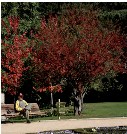
■■■■ Campo del Moro. Palacio Real